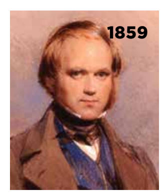
▲ Charles Darwin