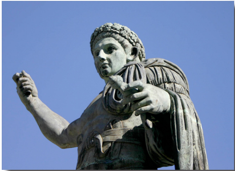
Bronze Statue of Constantine the Great

Time passed, and we come to the third church, Pergamos (Revelation 2:12-17). This era of church history describes the period of time when Constantine legalized Christianity and thousands of pagans, with their ideologies, flooded into the church. The era ended with the formation of the Papacy. The Revelator points out one of the grievous sins that found its way into the church during this period: “So hast thou also them that hold the doctrine of the Nicolaitans, which thing I hate.” (Revelation 2:15). Now there has been a lot of speculation as to what the “doctrine of the Nicolaitans” is, but considering what was happening to the church, the following explanation makes sense: