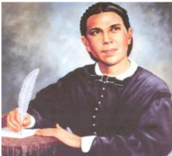
Ellen G. White

“The ministers are hovering over churches, which know the truth, while thousands are perishing out of Christ. If the proper instruction were given, if the proper methods were followed, every church member would do his work as a member of the body. . . . They should be taught that unless they can stand alone, without a minister, they need to be converted anew, and baptized anew. They need to be born again.” 4